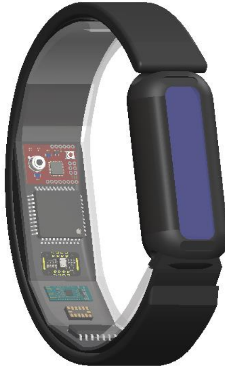
FRONT PERSPECTIVE VIEW