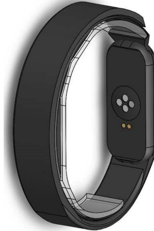
REAR PERSPECTIVE VIEW